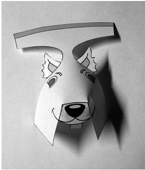
Color, cut and glue the sides down.