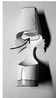
Glue it inside the head.