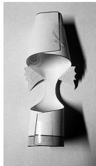
Glue around the head and neck.